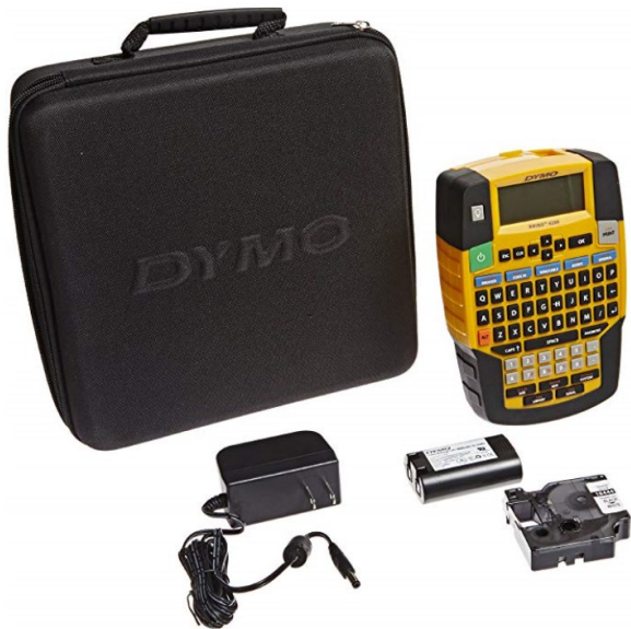
Rhino 4200 kit Case

Keyboard layout like your computer (QWERTY). One-touch formatted keys and module customization. Quick features such as "Favorites". Save customized settings and print shrink tube labeling. Used with tapes in widths of 6, 9, 12 and 19mm.