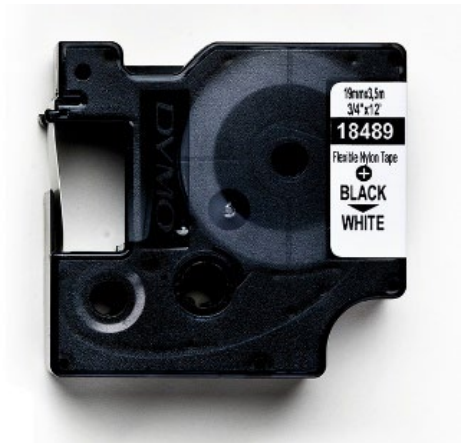
Rhino version tape

DYMO® marking tape is specifically designed for tough industrial environments. Available in different materials and for different applications. Marking tape in vinyl, polyester, nylon – also adhesive-free marking tape. Very strong adhesion (does not include adhesive-free marking tape).